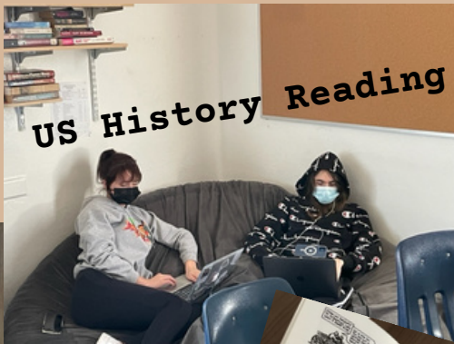
US History Reading Maus